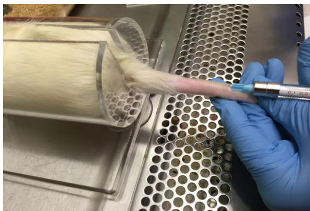
Figure 1. Subcutaneous Injection at the Base of the Tail